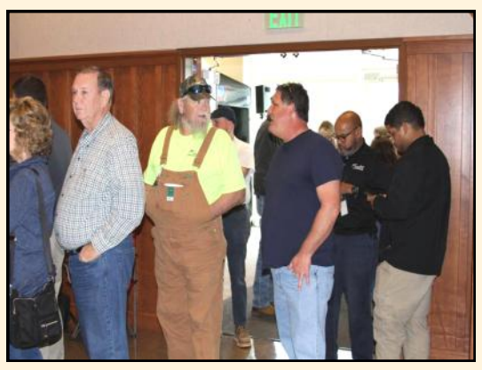
Lining up for BBQ and Marinated Turkey