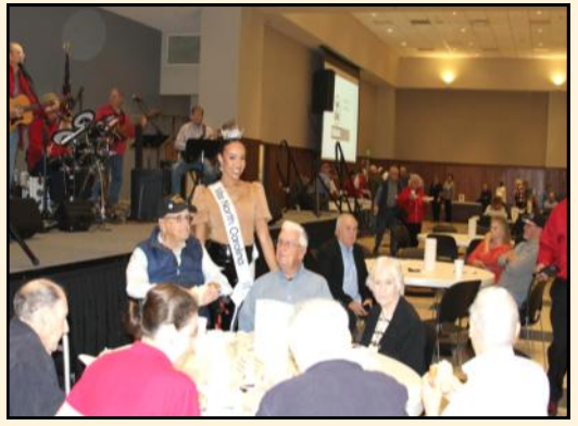
2023 Crime Stoppers BBQ